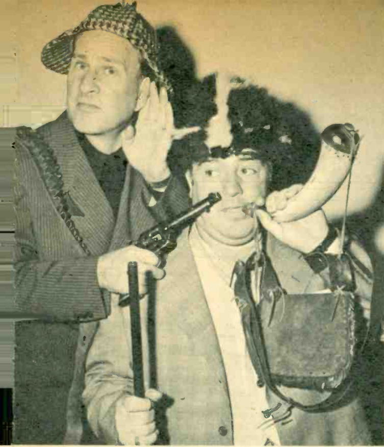
▲ NOBODY, LEAST OF ALL ABBOTT AND COSTELLO, is sure if the above is a tribute to Sherlock Holmes or Daniel Boone. Or maybe it represents the Call of the Wild—oh well, it's fun.