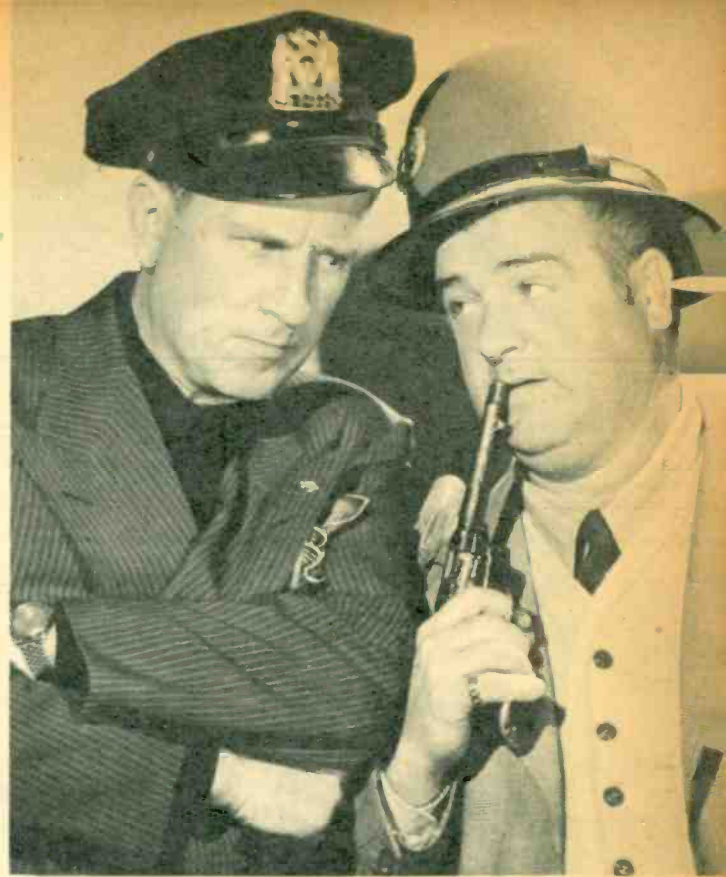
▲ "DID YOU DID OR DID YOU DIDN'T" questions Modern 40's Officer Abbott of Gay 90's Officer Costello. The boys like to pose for gag shots such as this but rarely can take time out from their busy picture and radio schedule.

wings and heard Lou throwing her a line which she recognized as a cue. What could she do? She could never reach the microphone in time. But quick-thinking Lou, sensing the situation, began reading her lines in a falsetto voice. "Next week," he